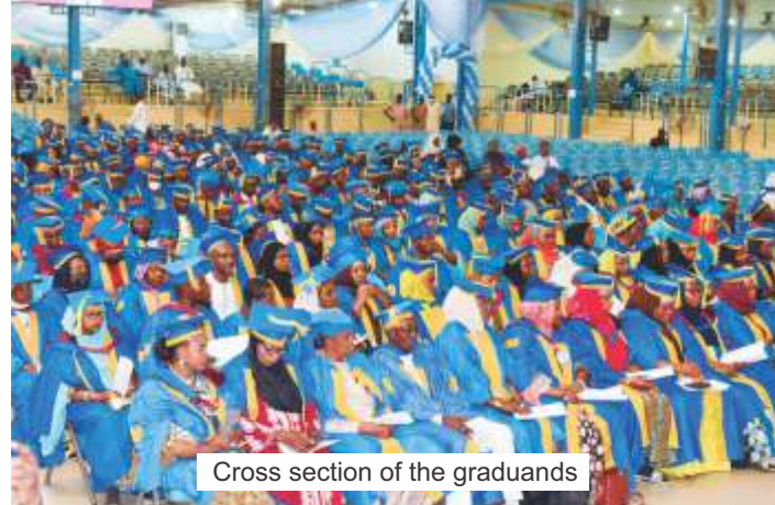
BUK and endeavor to give their best in the development of the community and the nation.

character and learning for the conferment of degrees at the congratulating the graduands for successfully completing third day of the 38th Convocation Ceremony held on their studies, urged them to be worthy ambassadors of