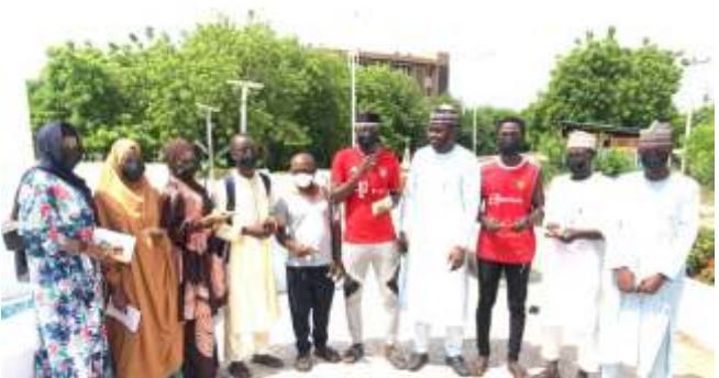
A group picture of the founder and students being assisted.

empowering knowledge, shaping the future and together we build brighter futures.