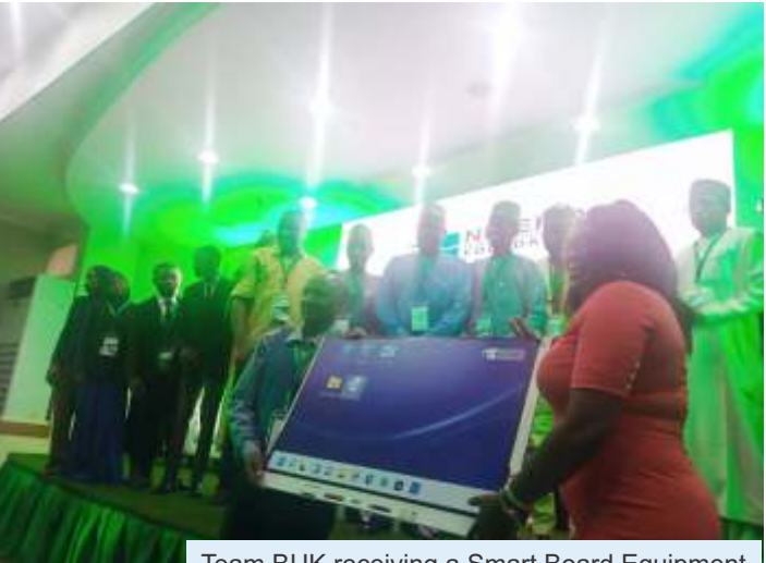
Team BUK receiving a Smart Board Equipment

The contemporary higher education ecosystem is a) characterized by vulnerability, uncertainty, complexity and ambiguity. The need for paradigm shifts by lecturers, students, and university leadership in areas such as student engagement, collaboration and lifelong learning for professional development. In particular, the following are fundamental to meeting the requirements for building future-ready