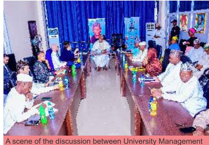
and French Ambassador to Nigeria

She spoke about the e-health program on early detection of malaria which is being funded by French Government, describing it as an important project which would be followed through.