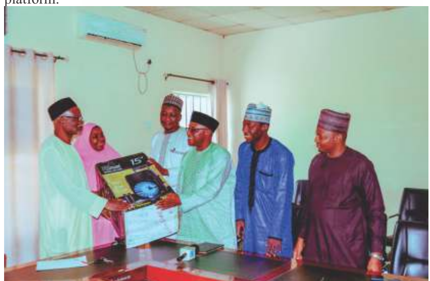
Members of class 2005 donating PAS to the Dean, Faculty of Communication

Some members of the class who live outside the country and those who couldn't attend spoke and wished their colleagues well via google meet platform.