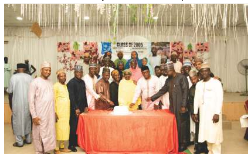
Members of Class 2005 cutting the reunion anniversary cake