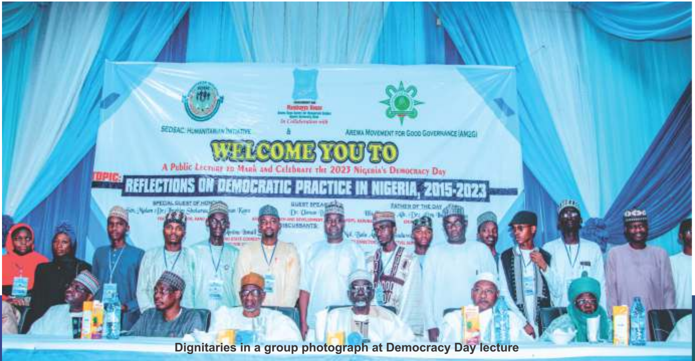
Dignitaries in a group photograph at Democracy Day lecture