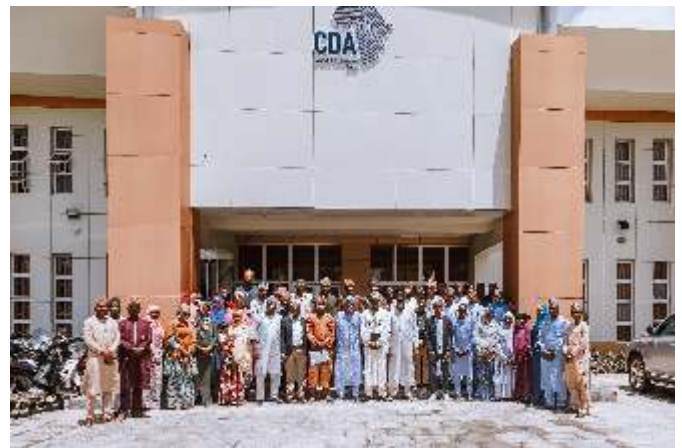
A group photograph of CDA Postgraduate students and facilitators

The orientation program which took place on 13 th June, 2023 at the CDA Conference Hall, was also meant to familiarize the students with the campus life, postgraduate study guidelines, available resources and the university's policies.