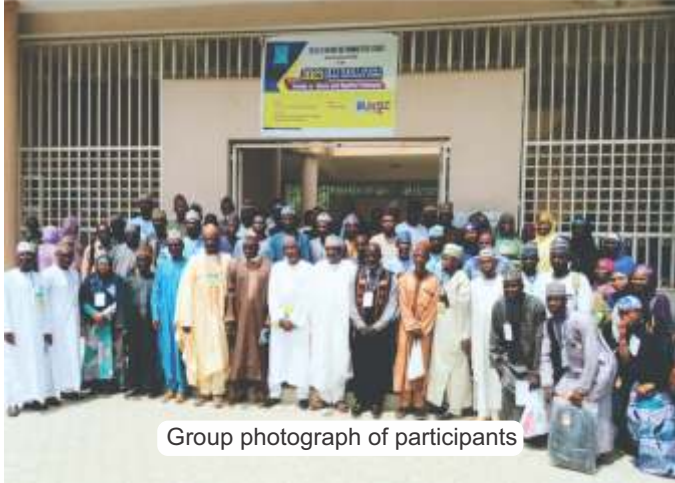
Group photograph of participants

College of Natural and Pharmaceutical Sciences, Bayero University, organized International Science Conference Hybrid with the aim of educating public on how to make good use of Basic and Applied scientific