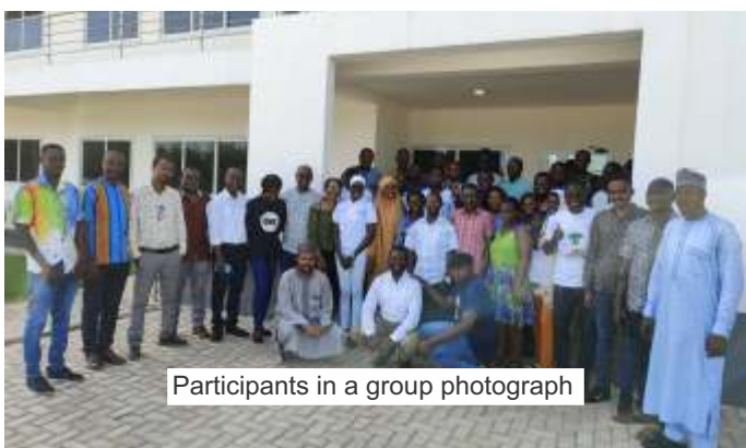
Participants in a group photograph

Vol. XLI No. 55 Bulletin Friday, 25th November, 2022