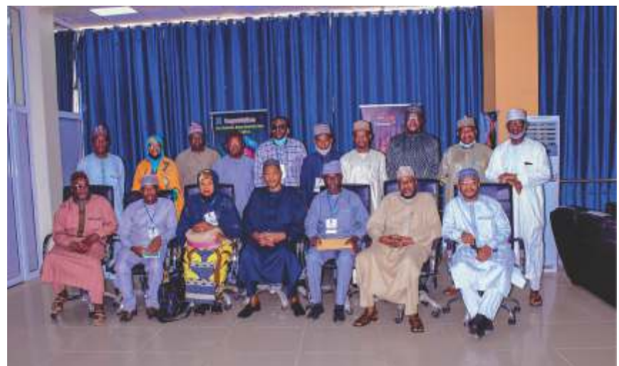
Members of the NBMA in a group phtograph with BUK Management

and quality research that will be acceptable by appropriate authorities and provide solutions to address societal challenges.