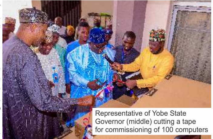
Representative of Yobe State Governor (middle) cutting a tape for commissioning of 100 computers