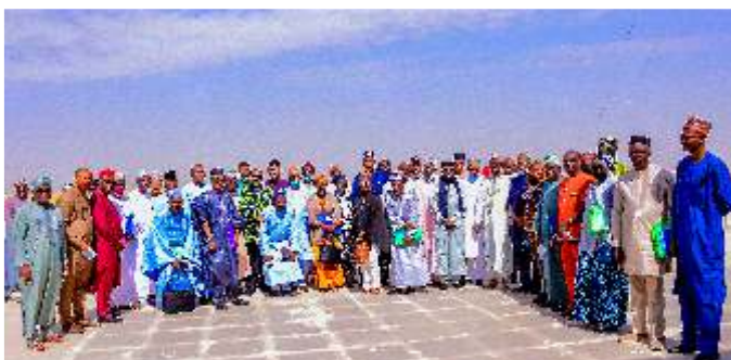
A group photograph of 8 teams for accreditation of 9 programmes, Principal officers and Faculty Representatives

The programmes being accredited are: Agriculture, English and Linguistics, Islamic Studies, Applied Biology, Computer Science, Banking and Finance, Business Administration, as well as Theatre and Performing Arts.