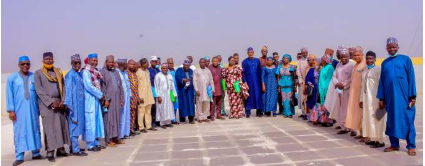
A group photograph of six teams for accreditation of 7 programmes with the University Management and Faculty Representatives