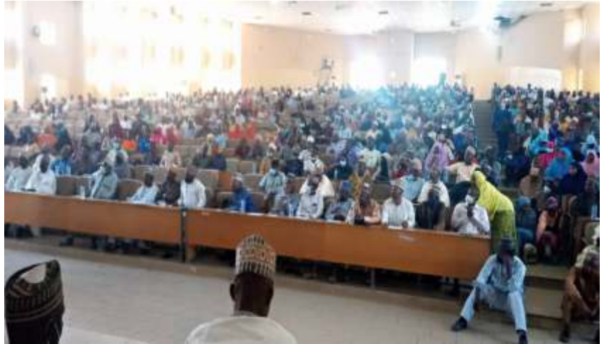
A cross section of students listening to the lecture

He said SMEDAN organizes opportunity fairs with the aim of facilitating backward and forward business linkages, developing the relationship networks that often lead to business and providing access to both local and international market opportunities.