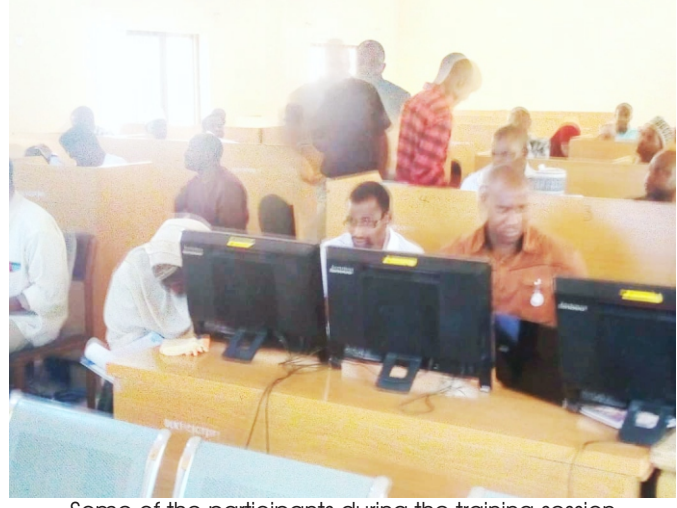
Some of the participants during the training session

The NCC working through its training arm, the Digital Bridge Institute, has trained the participants in Advanced Digital Appreciation Programme widely known as ADAPTI. The NCC-funded ADAPTI programme is aimed at bridging the ICT skills gap of teaching and non-teaching staff in tertiary institutions in the country.