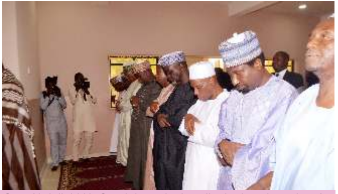
Gov. Abdullahi U. Ganduje and other dignitaries observing Asr prayer shortly after the commissioning ceremony