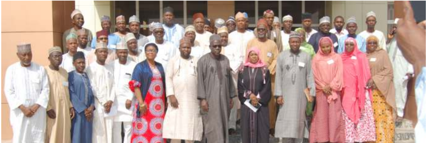
Members of the University Management and participants shortly opening session