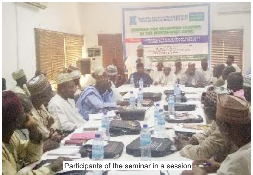
Participants of the seminar in a session

Scholars and religious leaders presented papers at the occasion some of which were Islamic Teachings in Anti-Corruption Discourse and Initiatives by the Secretary of the Islamic Forum of Nigeria, Kano,