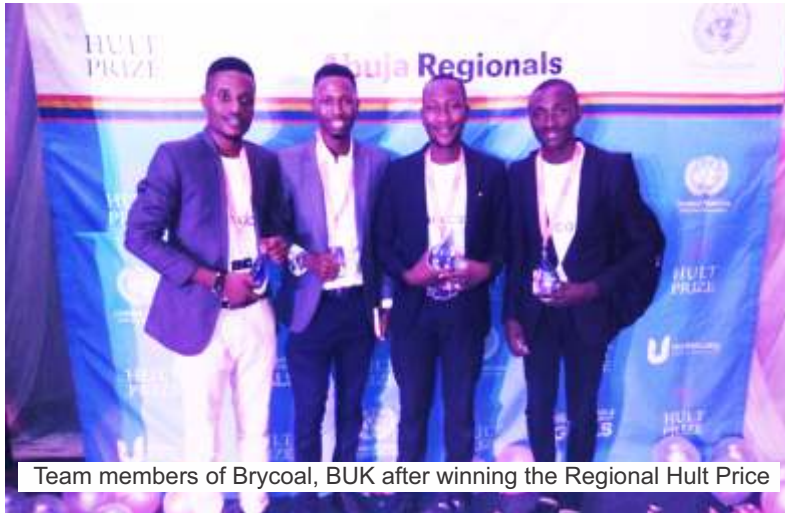
Team members of Brycoal, BUK after winning the Regional Hult Prize

emerging from universities around the world. This gives the team the unique opportunity to compete for USD 1 Million at the United Nations HQ in September.