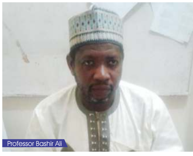
Vol. XXXVIII No. 29 Bulletin Friday, 28th June, 2019

According to him, his election is well deserved as it attest to his commitment to the promotion of Mathematics as a subject and the NMS as a group."The election is well deserved and we are proud of you," he said.