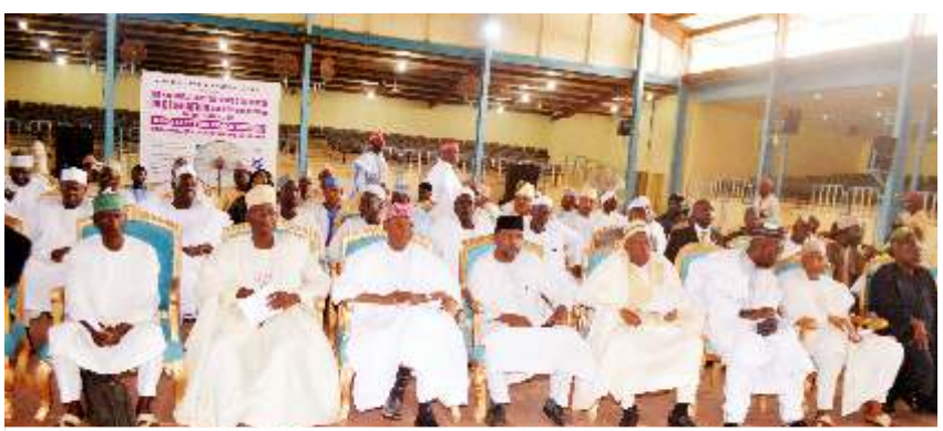
A photograph of Kano State Gubernatorial candidates during signing of the peace accord

According to the Emir the blood of a fellow human