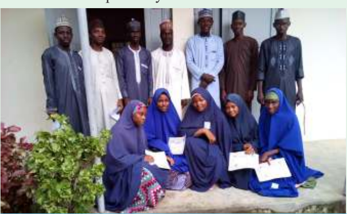
Winners of the competition in a group photograph with their teachers

Certificates and awards were presented to participants and winners respectively.