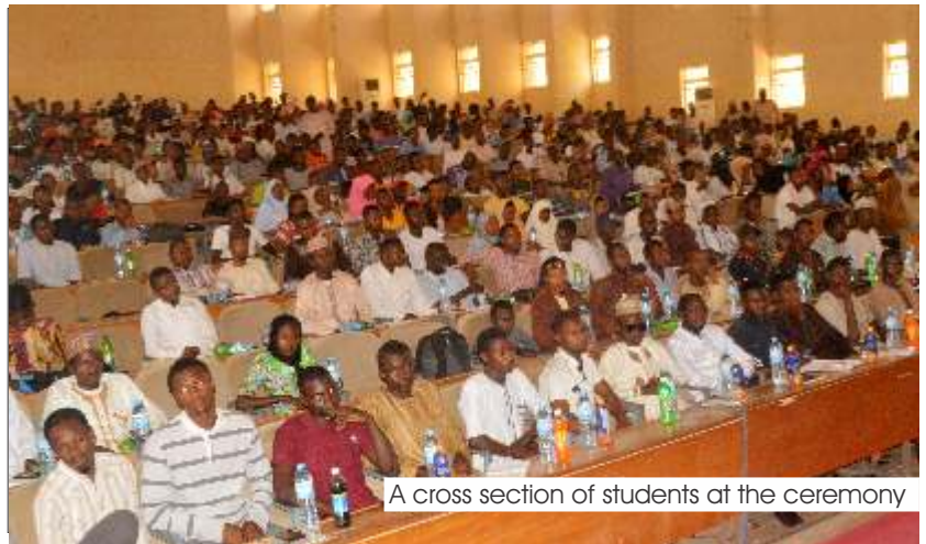
A cross section of students at the ceremony