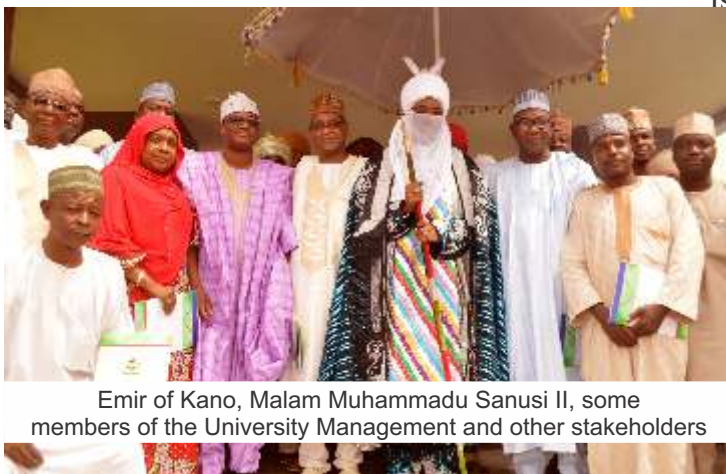
Emir of Kano, Malam Muhammadu Sanusi II, some members of the University Management and other stakeholders