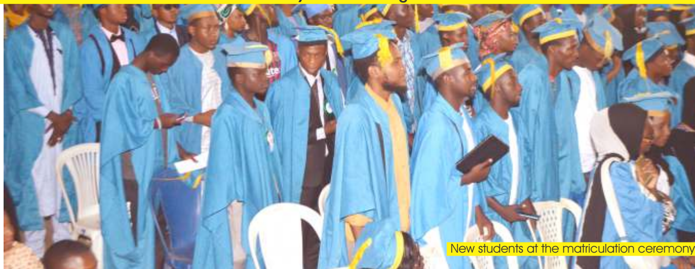
New students at the matriculation ceremony

Bayero University, Kano has matriculated eight thousand and ninety students who were given admission into the University for the current 2018/2019 academic session.