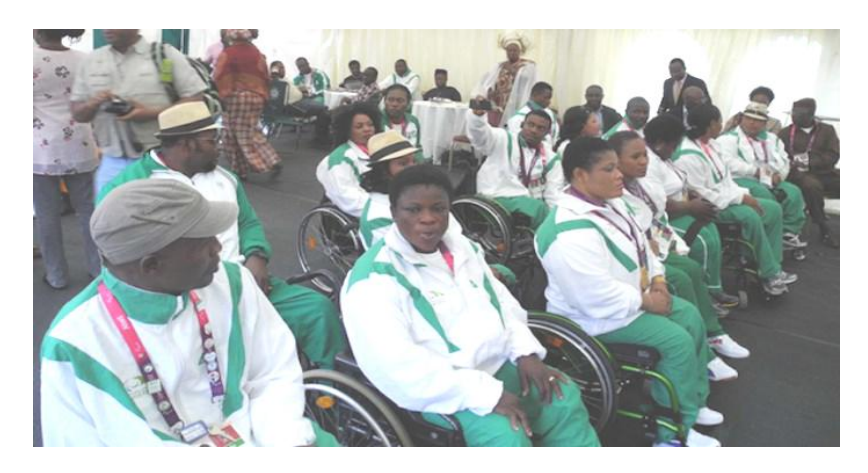
Fig. 10: Nigeria's contingent at the Rio Paralympics Games 2016 in Brazil

2016 Summer Paralympics Game held from 7 to 18 September in Rio de Janeiro, Brazil