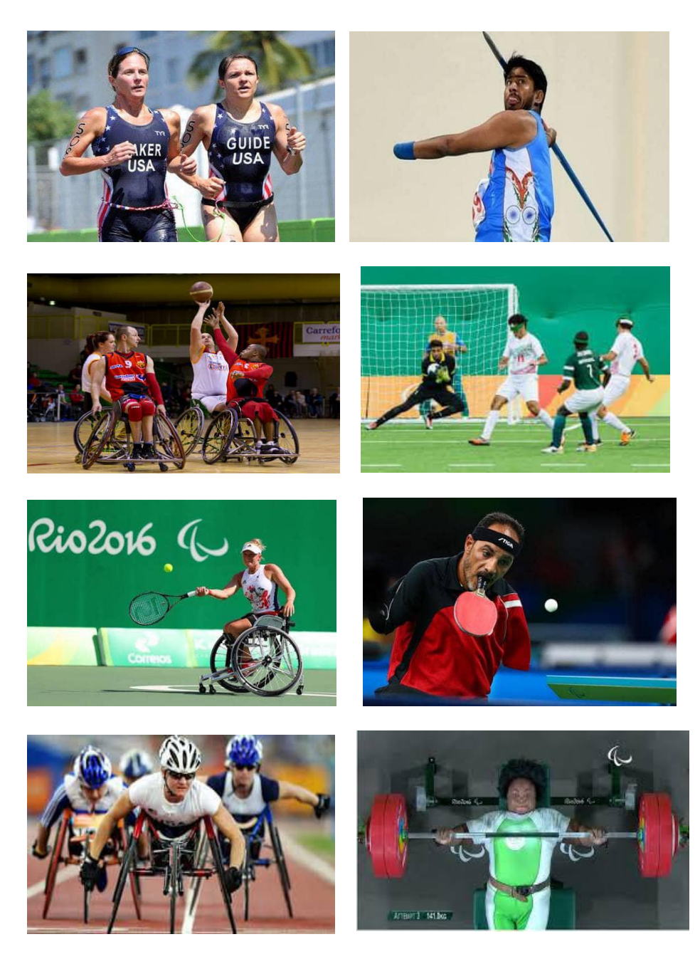
Fig. 3: Some suitable sports for persons with disabilities