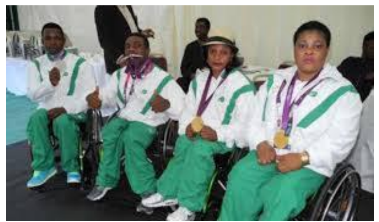
Fig. 4: Nigeria's contingent at the Barcelona Paralympics Games 1992 in Spain

Two Nigerian Paralympics athletes won three gold medals for Nigeria in the 1992 Summer Paralympics Games held in Barcelona. They participated in the Men's Sprint events (100m & 200m TS4) and Men's powerlifting event (48kg).