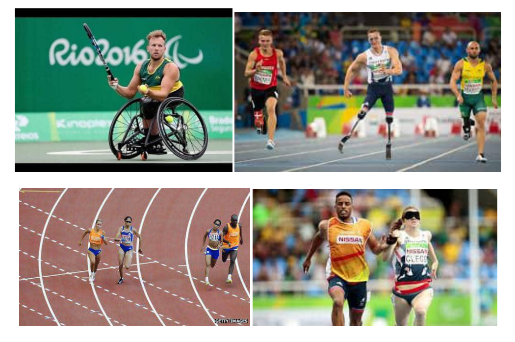
Fig: 2 Sports/Competitions