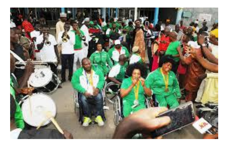
Fig. 7: Nigeria's contingent at the Athens Paralympics Games 2004 in Greece

Nigeria participated in the 2004 Summer Paralympics held in Athens where they won five gold medals in Men's Para-Athletics events (100m, 200m and 400m T12,), Javelin (F58) and Women's powerlifting event (44kg). Nigeria also won four silver medals in Women's Para-Athletics event (Javelin F56-58), powerlifting events (40kg and 56kg) and Men's powerlifting event (100kg) and further won three bronze medals in Women's powerlifting events (48kg, 75kg and +82.5kg) respectively.