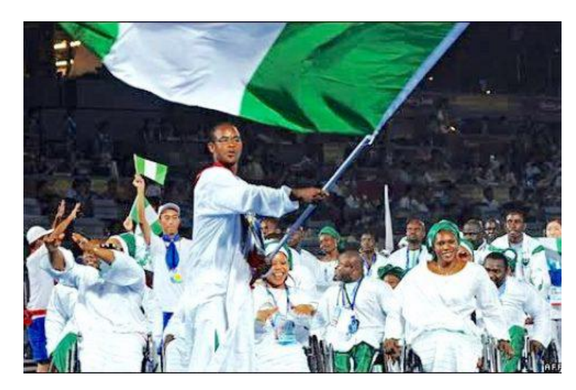
Fig. 5 Nigeria's contingent at the Atlanta Paralympics Games 1996 in USA