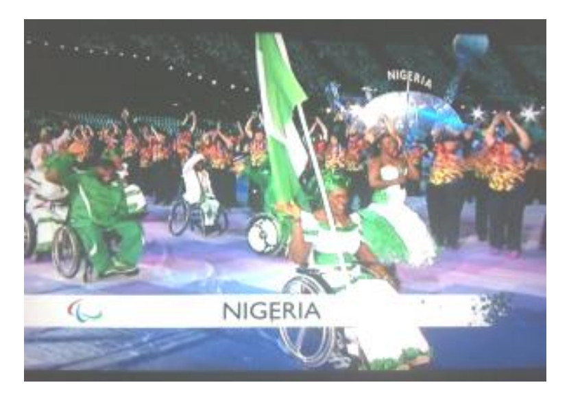
Fig. 9: Nigeria's contingent at the London Paralympics Games 2012 in UK

Nigeria won a total of four gold medals in the 2012 Summer Paralympics Game held in London, United Kingdom in Men's Powerlifting Event (48kg) and Women's Powerlifting Events (44kg, 48kg and 52kg). Nigeria also won five silver medals in Men's powerlifting events (52kg, 56kg and 60kg), Women's Powerlifting Events (56kg and 75kg) and two bronze medals in Women's Para-Athletics event (Shot put F57-58) and Powerlifting Event (67.5kg) respectively.