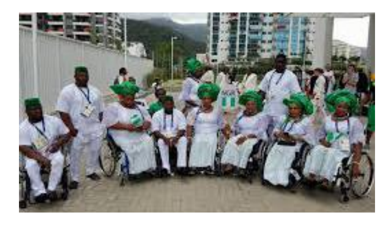
Fig. 8: Nigeria's contingent at the Beijing Paralympics Games 2008 in China