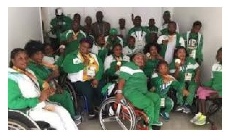
Fig. 6: Nigeria's contingent at the Sidney Paralympics Games 2000 in Australia

In the 2000 Summer Paralympics held in Sydney, Australia a total of seven athletes that represented Nigeria won a gold medal each in their various events. They featured in Women's Javelin (F58), Power lifting events (48kg, 60kg and 67.5kg), Men's Power-lifting event (67.5), Men's Table Tennis Singles and Doubles Events (Class 9 each). Nigeria also won a silver medal in Women's power-lifting event (44kg) and five bronze medals in Men's power-lifting event (56kg) and Women's events (52kg, 75kg and +82.5kg) as well as Men's Table Tennis event (singles class 9) respectively.