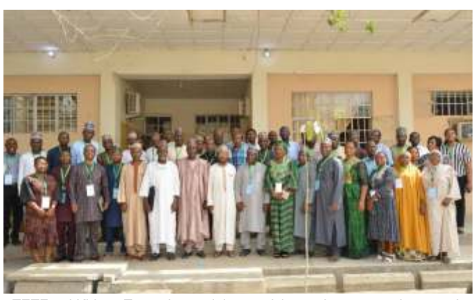
TETFund Kidney Transplant training participants in a group photograph

equipment to the Universities Teaching Hospitals. He said teaching hospitals often served as laboratories to most of the researches conducted in College of Health Sciences