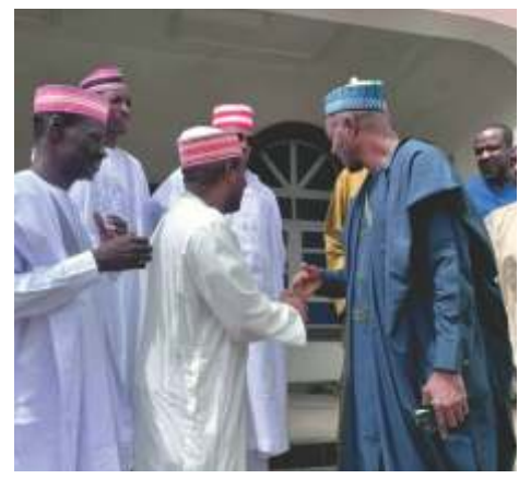
The VC being received by the Speaker

"It may interest you to know that because of the