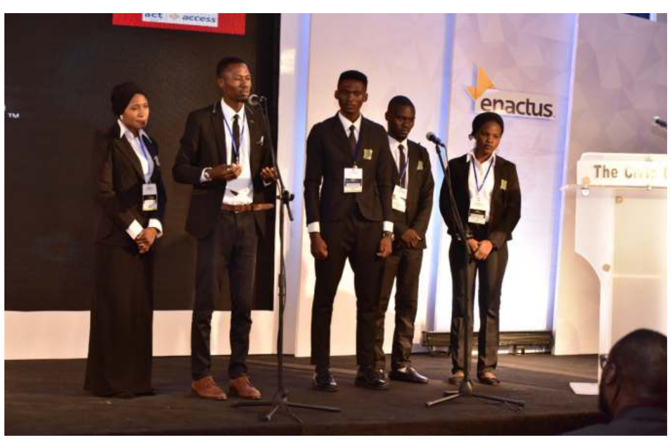
BUK ENACTUS Team