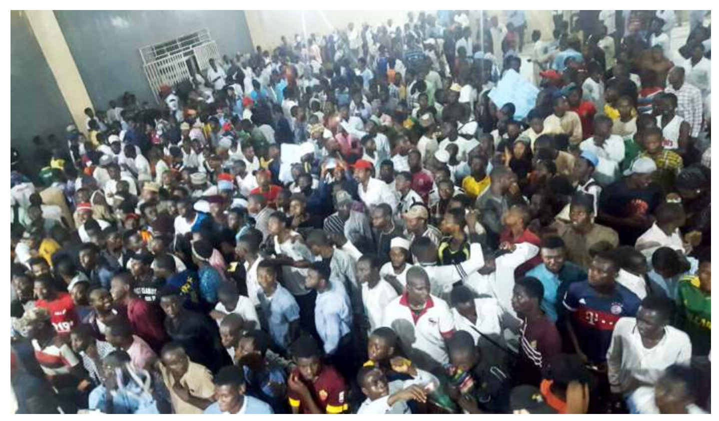
A cross section of students during the rally at Sports Complex, Old Campus