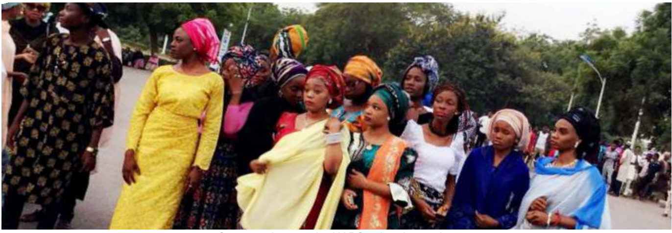
Some students at the NABS cultural occasion

NABS also organized a novelty match between Level Four and Level One students which ended 2 - 0 in favour of Level 4, thanks to Abubakar Sadik "brace."