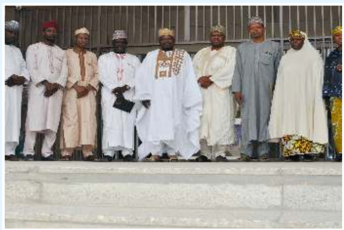
Delegation from Federal College of Education (FCE), Kano