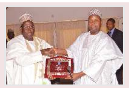
Scenes from the commissioning and (1st right) the Executive Secretary receiving a plaque from the VC