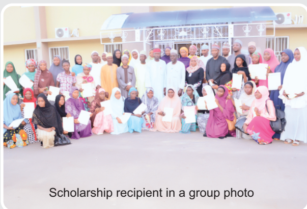
Scholarship recipient in a group photo