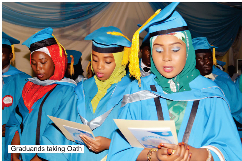
Graduands taking Oath