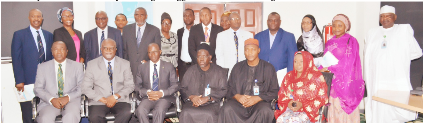
A group photograph of principal officers of BUK and board members of National Postgraduate Medical Council College of Nigeria

The National Postgraduate Medical College of Nigeria is a parastatal of Federal Government Ministry of Health. It was established on 24 th September, 1979 under the Decree No 67 now Cap No 59 Laws of the Federation 2004, as a Corporate body to medical specialists, capable of providing world-class research, teaching and health care. Today, the College is the apex of medical education in Nigeria.