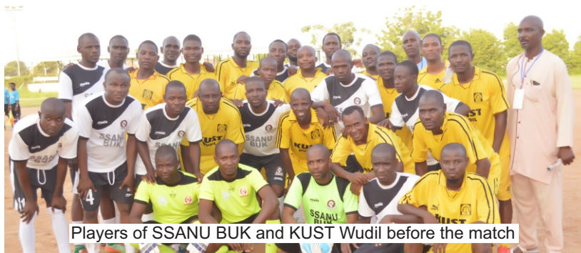
Players of SSANU BUK and KUST Wudil before the match