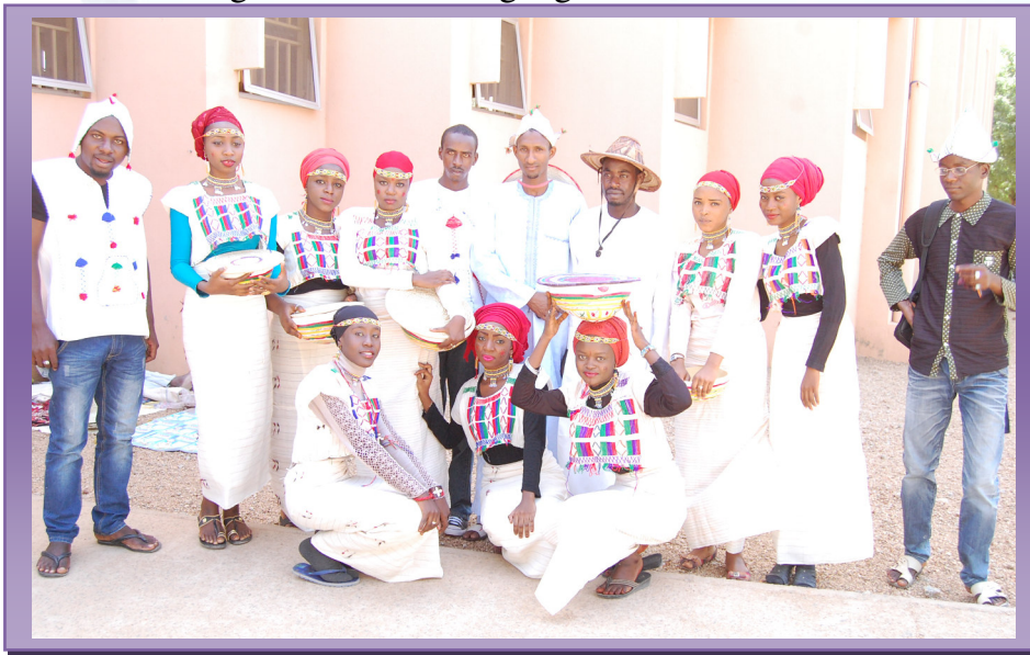
Executive members of the Fulfulde Promotion Club in a group photograph

Fulfulde Promotion Club of Bayero University, Kano held Fulfulde Day on Saturday, 14 th November, 2015, which is an occasion meant to swear-in the new executives to bring together the Fulani community in the University and outside, and to listen to lectures on issues bothering the Fulfulde language and the Fulbe.