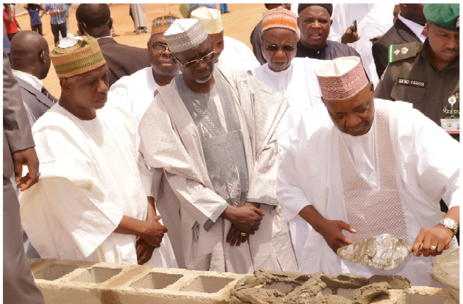
Vice President, Arch Mohammed Namadi Sambo (1 st right) performing the foundation laying of a female hostel at the New Campus

The Federal Government has expended 644 billion Naira through the Tertiary Education Trust Fund (TETFund) in the institutions of higher learning across the country in pursuit of academic excellence in the Nigerian universities, Vice President, Arch Mohammed Namadi Sambo, has disclosed.