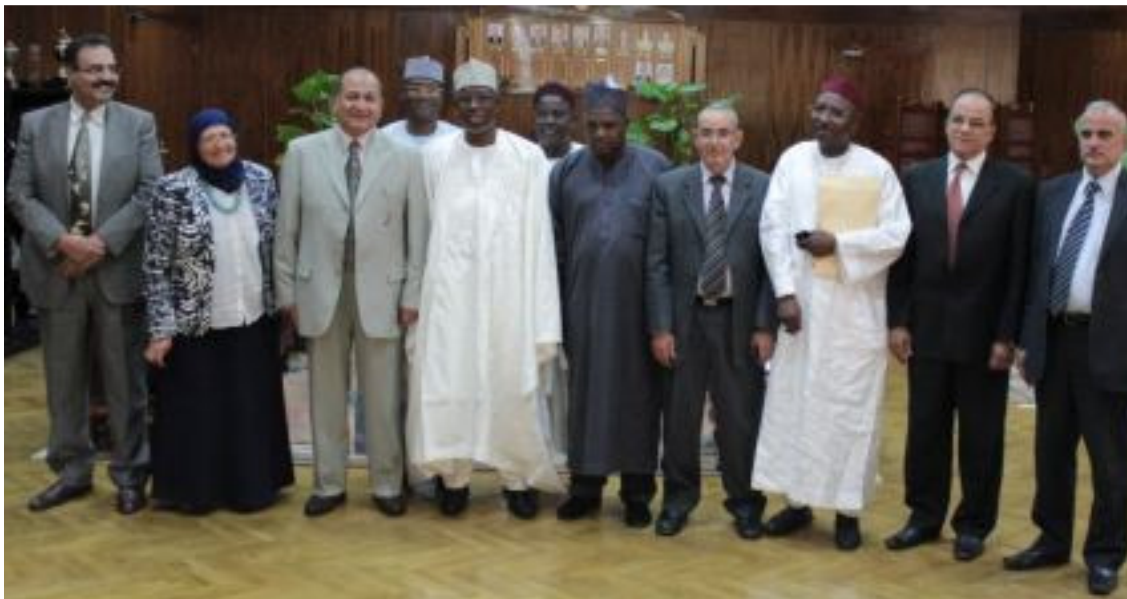
A group photograph of BUK contingent and management of Tanta University

The memorandum of understanding signed between Bayero University, Kano and Tanta University, Egypt has started yielding result with the appointment of three senior academics from the Egyptian University to teach in the Faculty of Nursing, B.U.K. The appointment letters were issued to them and they willingly wrote and submitted their acceptance letters.