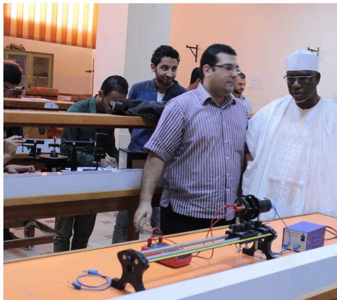
VC (1 st right) in one of the laboratories