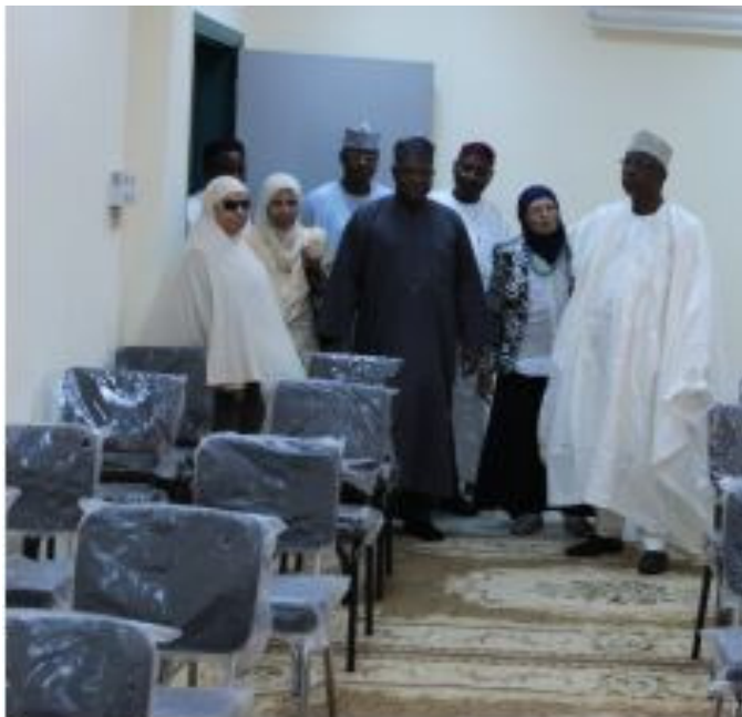
BUK contingent inspecting facilities