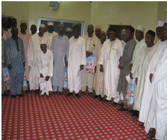
COREN accreditation team in a group photo with BUK Management & Faculty of Engr. Staff.